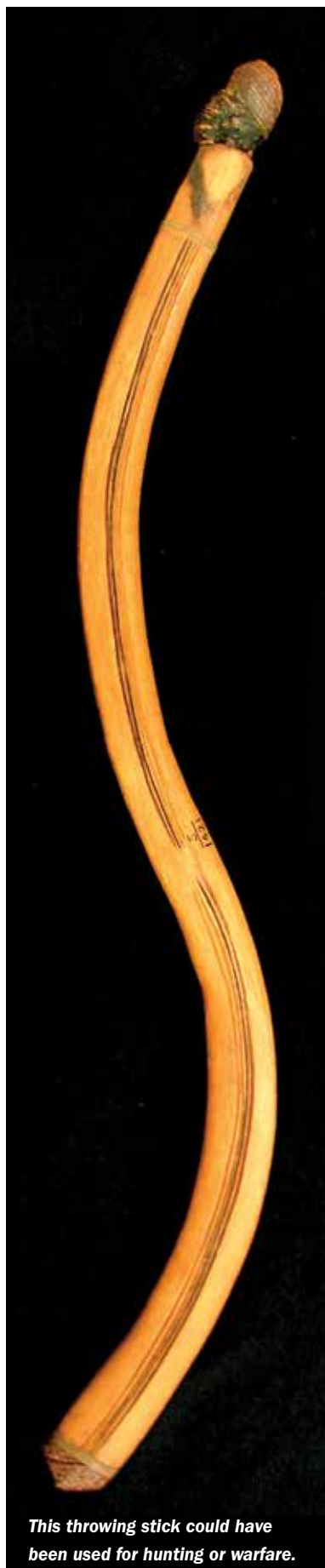
This throwing stick could have been used for hunting or warfare.