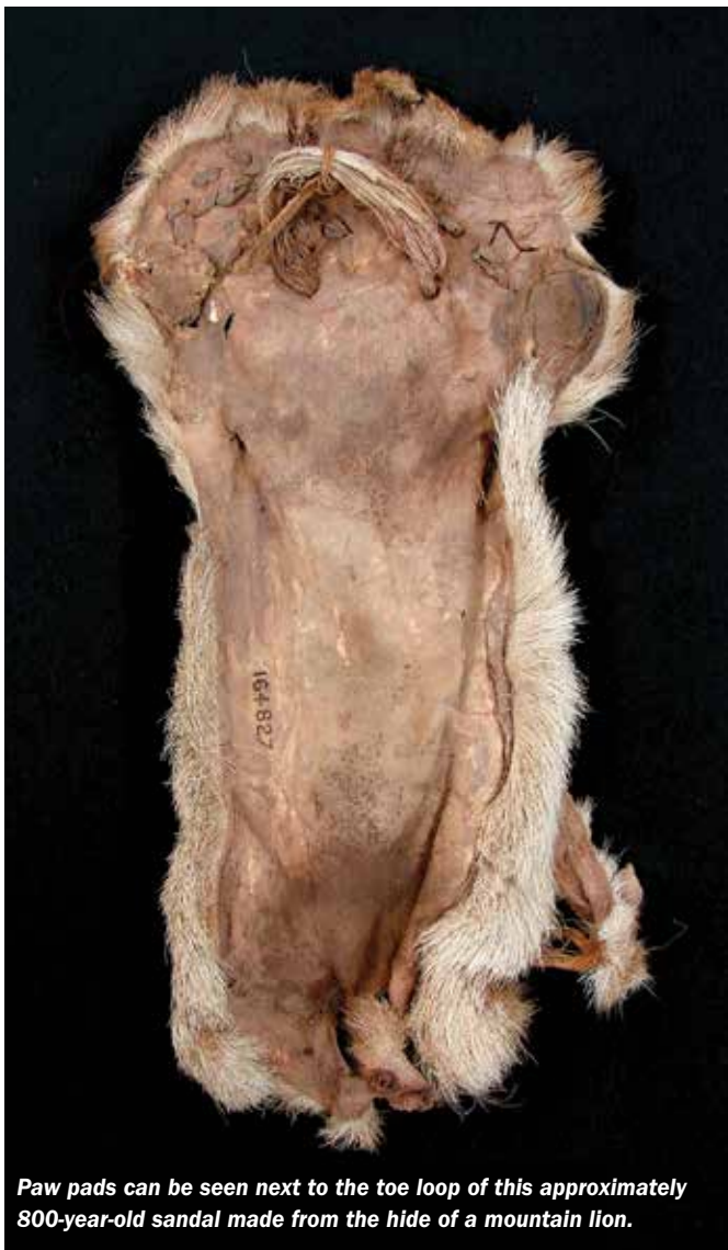
Paw pads can be seen next to the toe loop of this approximately 800-year-old sandal made from the hide of a mountain lion.

© THE FIELD MUSEUM, CAT. NO. 164827 / LAURIE WEBSTER