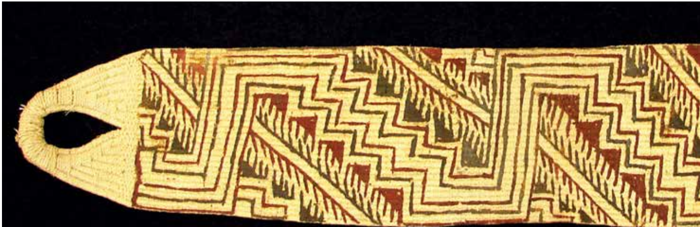
Bands like this pristine painted yucca tumpline were worn around the forehead or chest to support loads carried on the back. This tumpline is roughly 1,300 years old.