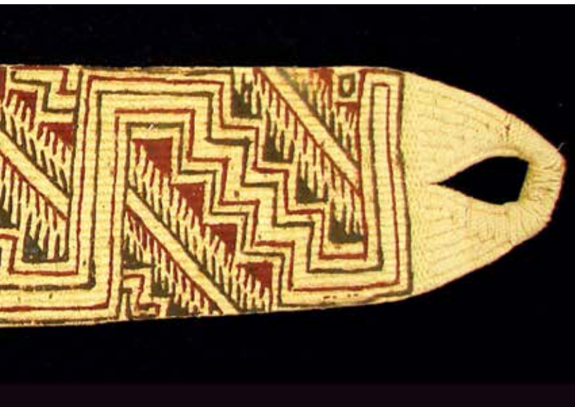
CAT. NO. 165170