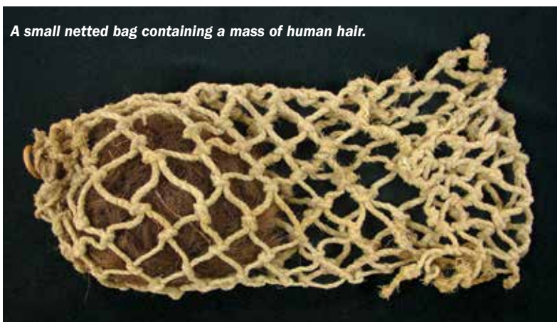
A small netted bag containing a mass of human hair.

COURTESY OF THE DIVISION OF ANTHROPOLOGY, AMERICAN MUSEUM OF NATURAL HISTORY CAT. NO. H/12452 / LAURIE WEBSTER