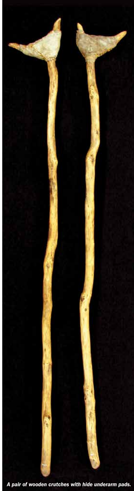
A pair of wooden crutches with hide underarm pads.

There may have been something special about human hair, as