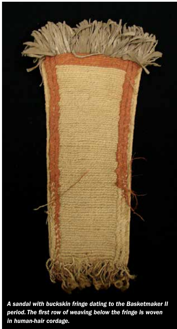
A sandal with buckskin fringe dating to the Basketmaker II period. The first row of weaving below the fringe is woven in human-hair cordage.

© THE FIELD MUSEUM, CAT. NO. 164827 / LAURIE WEBSTER