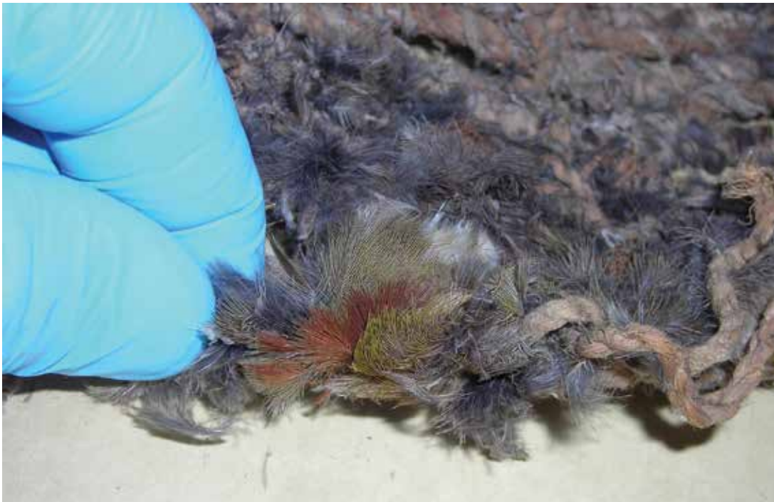
One of the many fascinating artifacts is a 2,000-year-old twined blanket made in part from the feathers of birds like the Green-tailed Towhee.

© THE FIELD MUSEUM, CAT. NO. 165242 / CHUCK LARUE